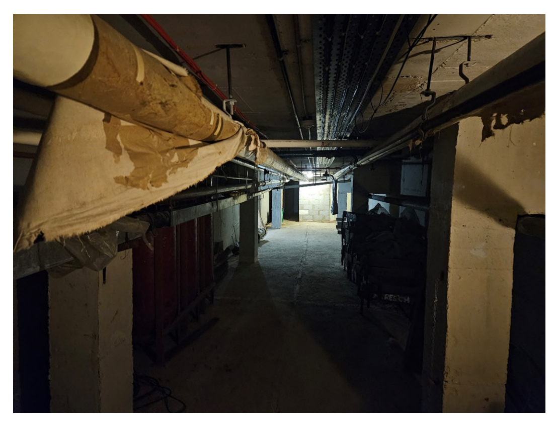
Figure 3: Tunnel with asbestos lagging