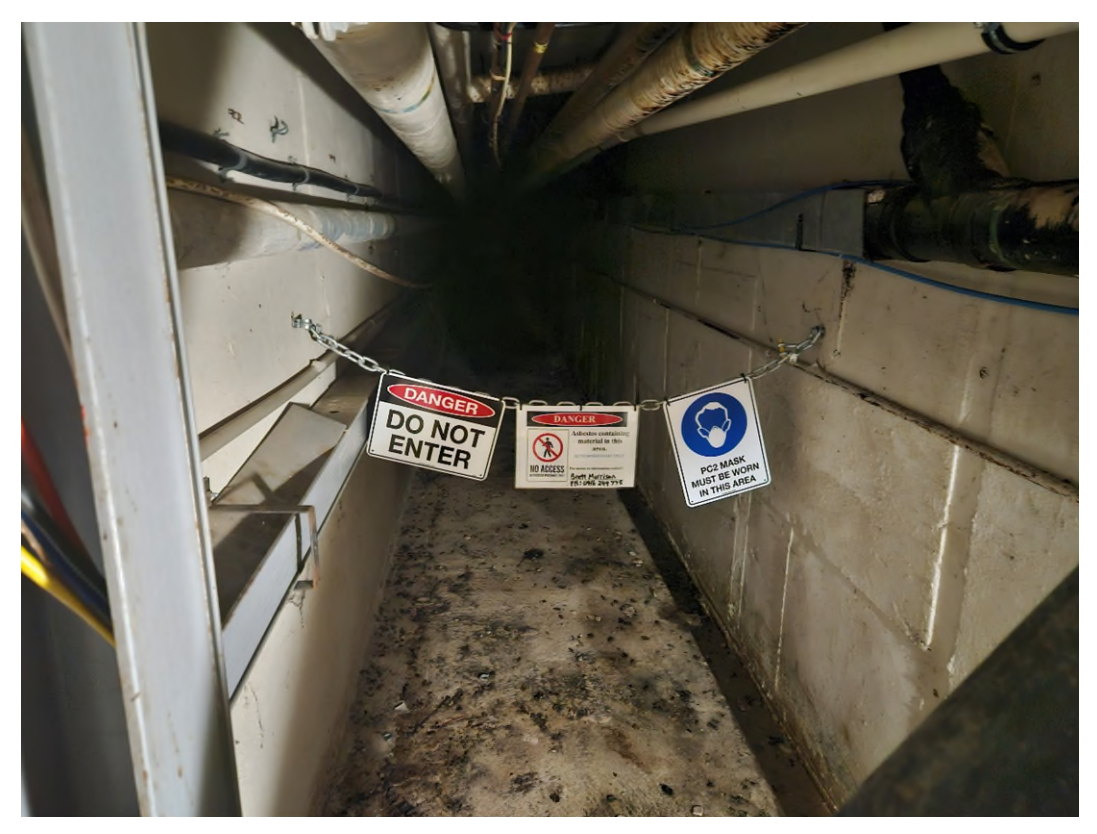
Figure 2: Tunnel

Due to the different types of services located in the tunnels; asbestos rope & lagging and sheeting, radioactive water and unknown gases, the tunnels should be considered to be a confined space. All access to the tunnels should be treated as a restricted area but under confined space conditions to ensure that workers safety in paramount.