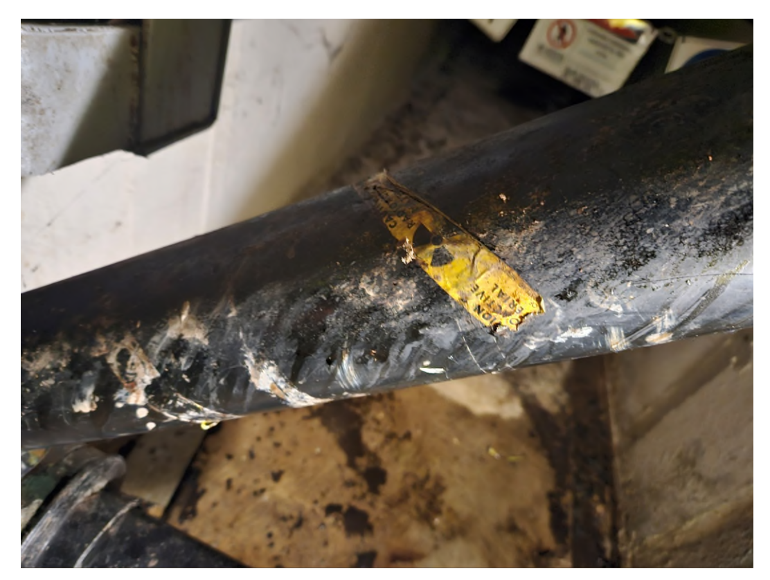
Figure 6: Radioactive water