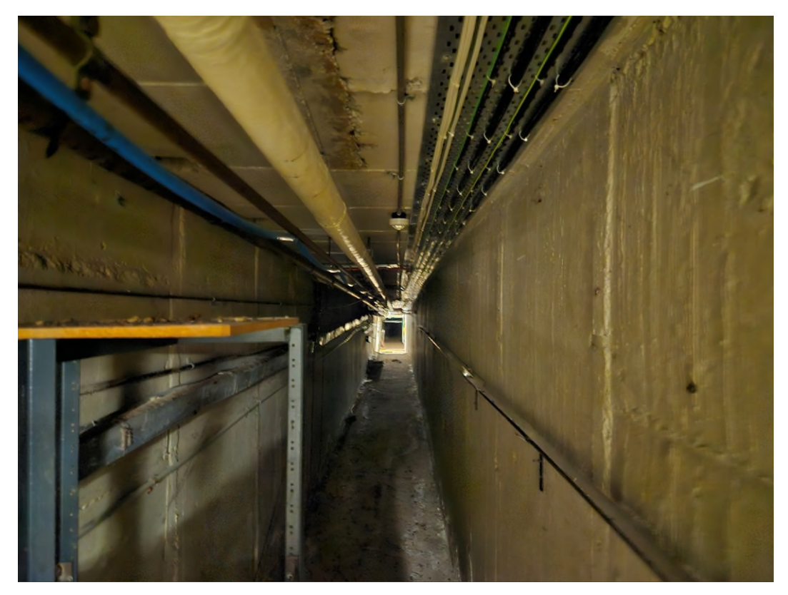
Figure 4: Tunnel