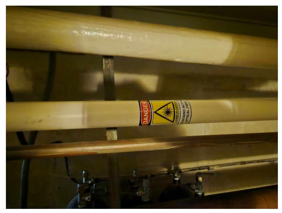
Figure 5: Hazardous gases and chemicals