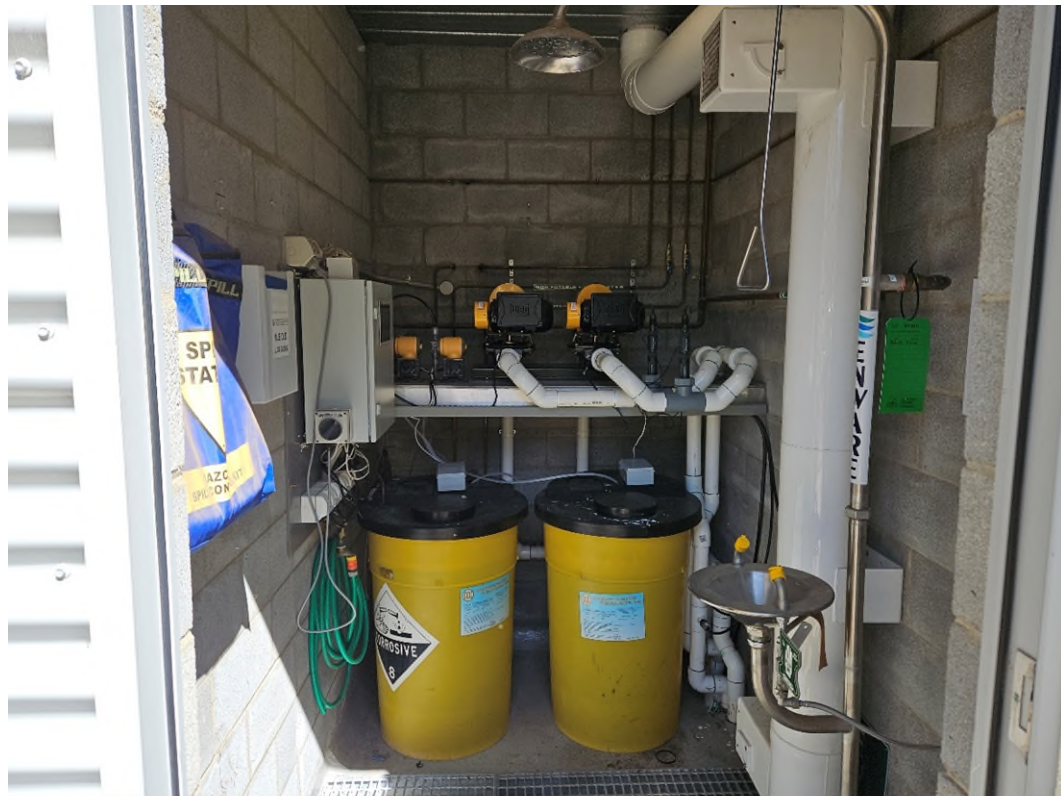
Figure 7: Chemical tanks