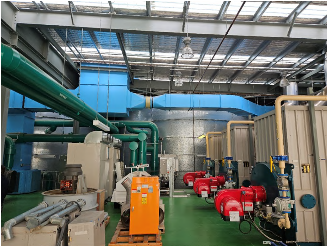
Figure 2: Various tanks in building 45A

Accessing the tanks for maintenance, annual cleaning or draining does expose the worker to the conditions within the tank, which require confined space entry procedures to ensure worker safety.