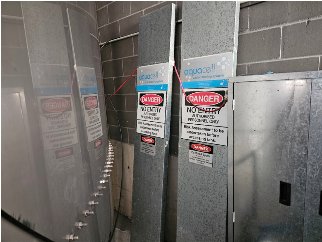
Figure 5 Access to various tanks in building 45A