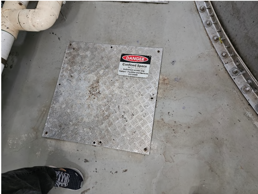
Figure 6 Access to various tanks in building 45A