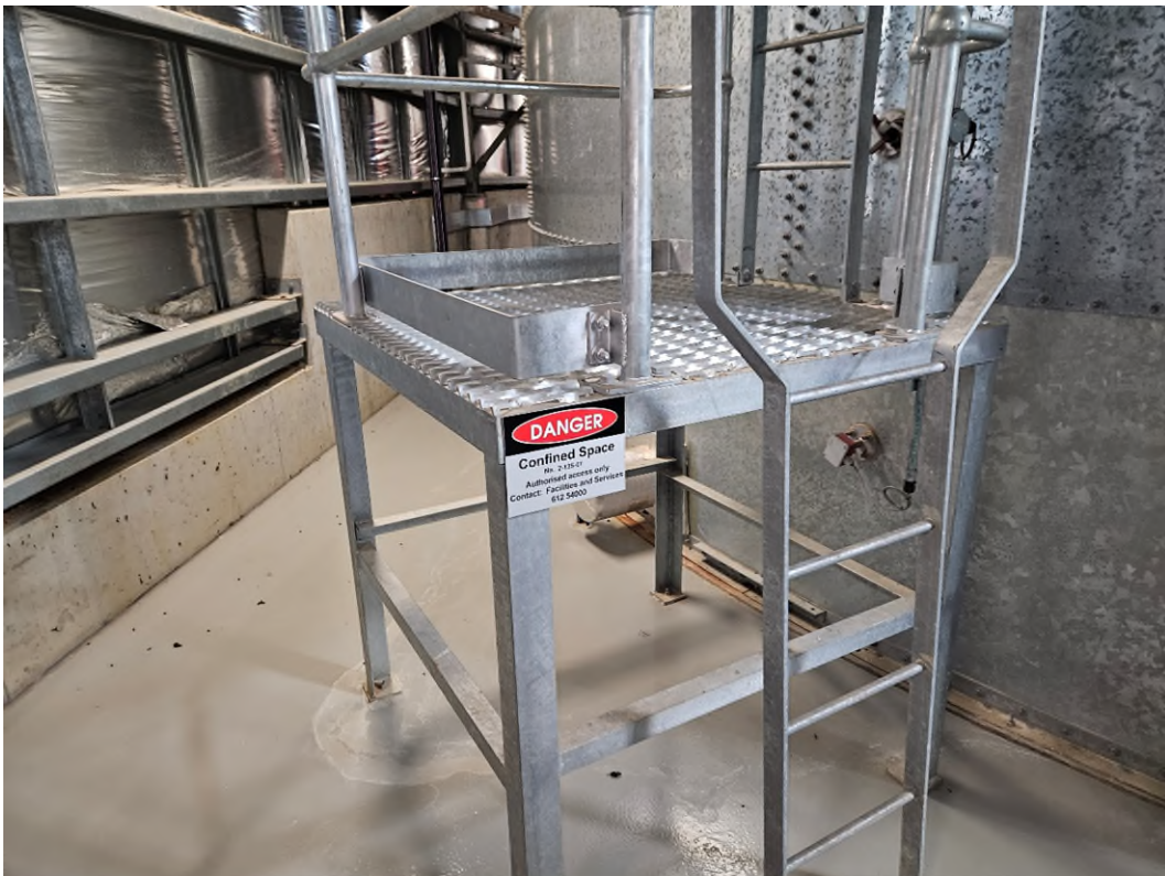
Figure 4: Access to various tanks in building 45A