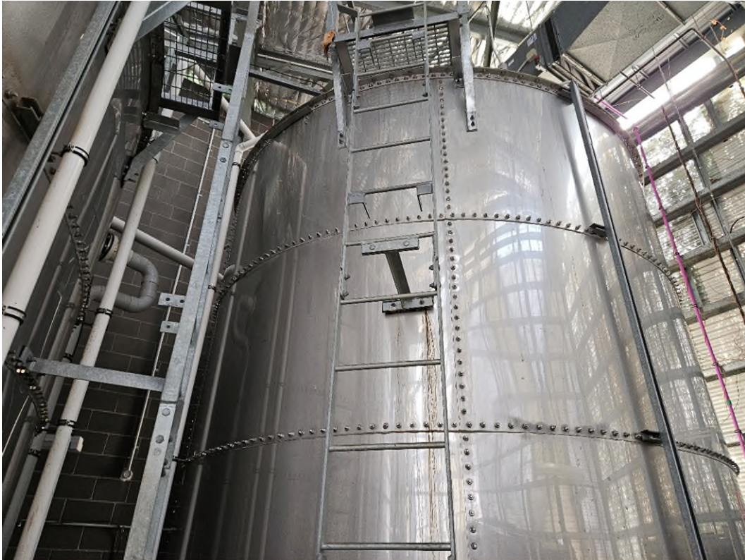
Figure 3: Tank - Various tanks in building 45A