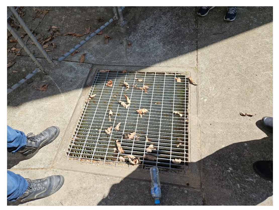
Figure 6: Stormwater Access