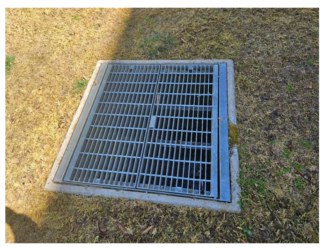
Figure 2: Stormwater Access

The access points are not considered to be a confined space because it is above ground and in an open area, but accessing for cleaning of blockages does expose the worker to the conditions within the stormwater system, which require confined space entry procedures to ensure worker safety.