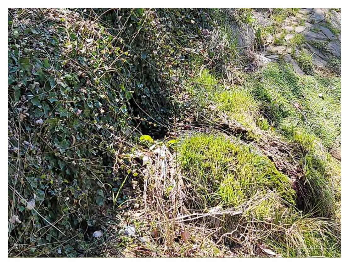
Figure 4: Stormwater access – along creek bank