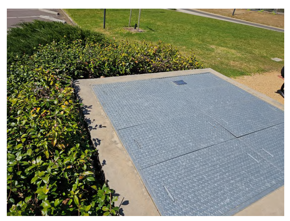
Figure 3: Stormwater access