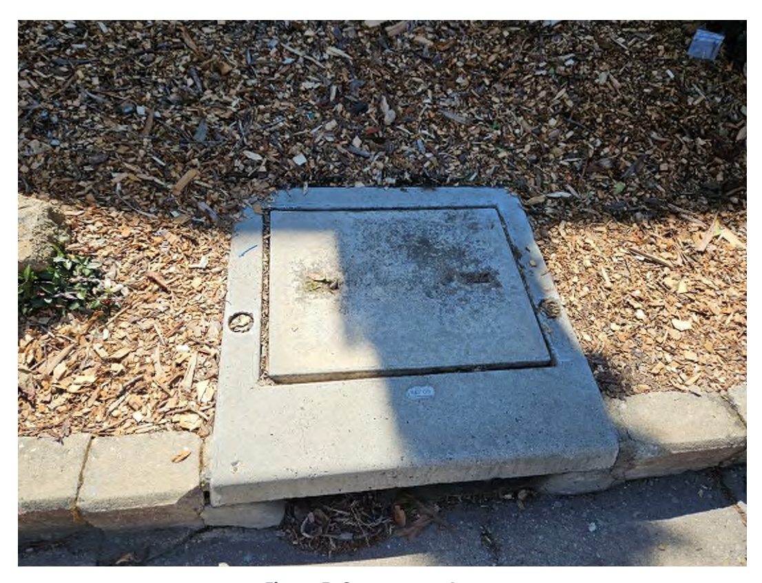
Figure 5: Stormwater Access