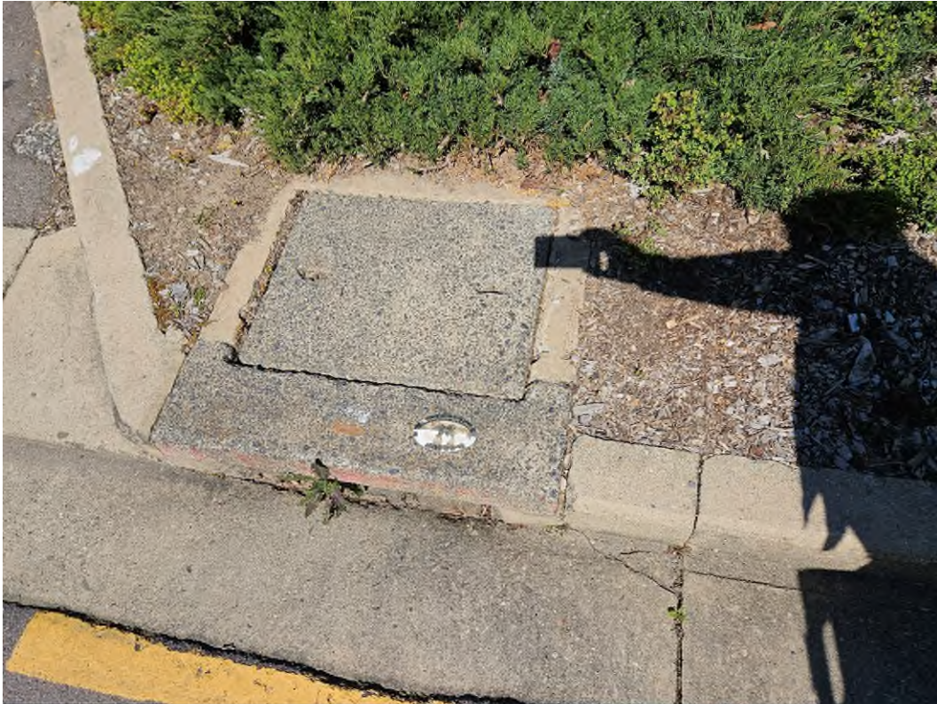
Figure 3: Sewer pits