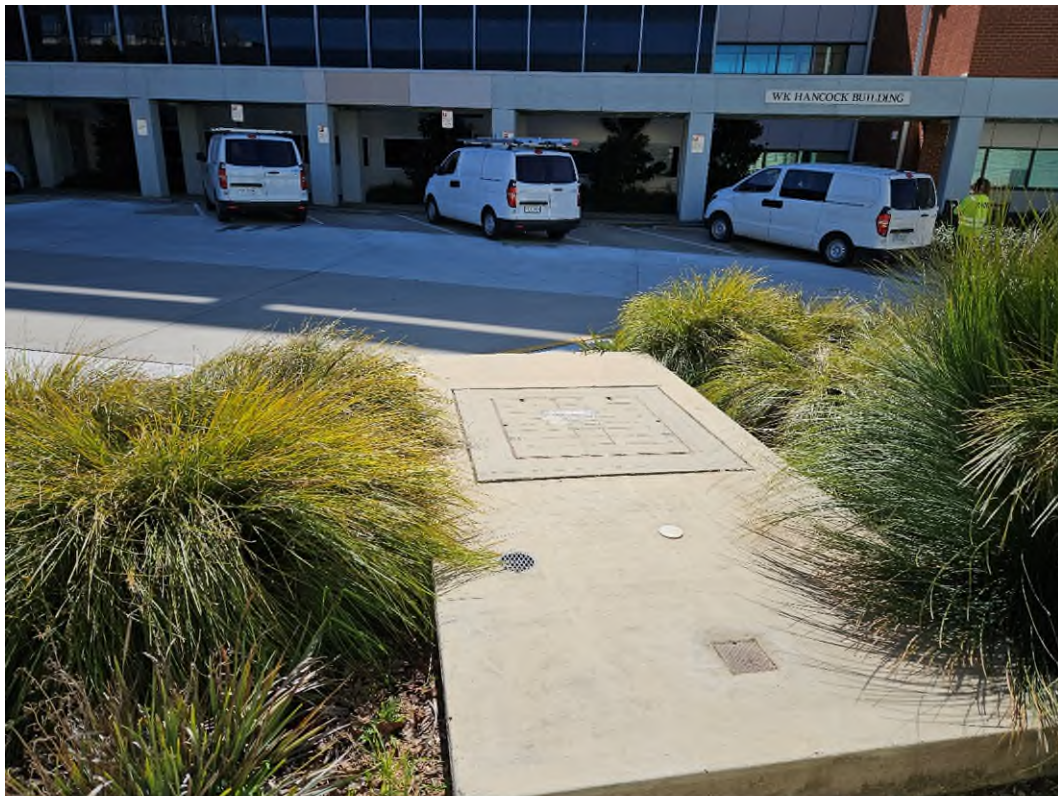
Figure 2: Sewer pits

The access points are not considered to be a confined space because it is above ground and in an open area, but accessing for cleaning of blockages does expose the worker to the conditions within the stormwater system, which require confined space entry procedures to ensure worker safety.