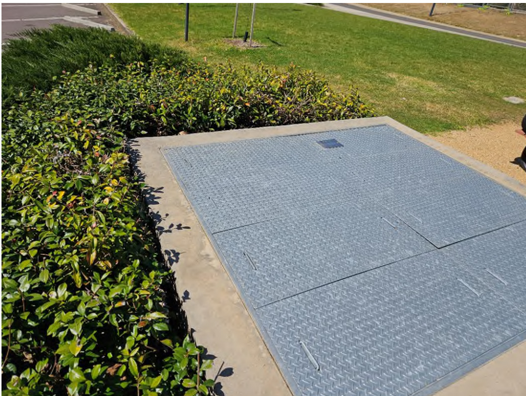
Figure 4: Sewer pits