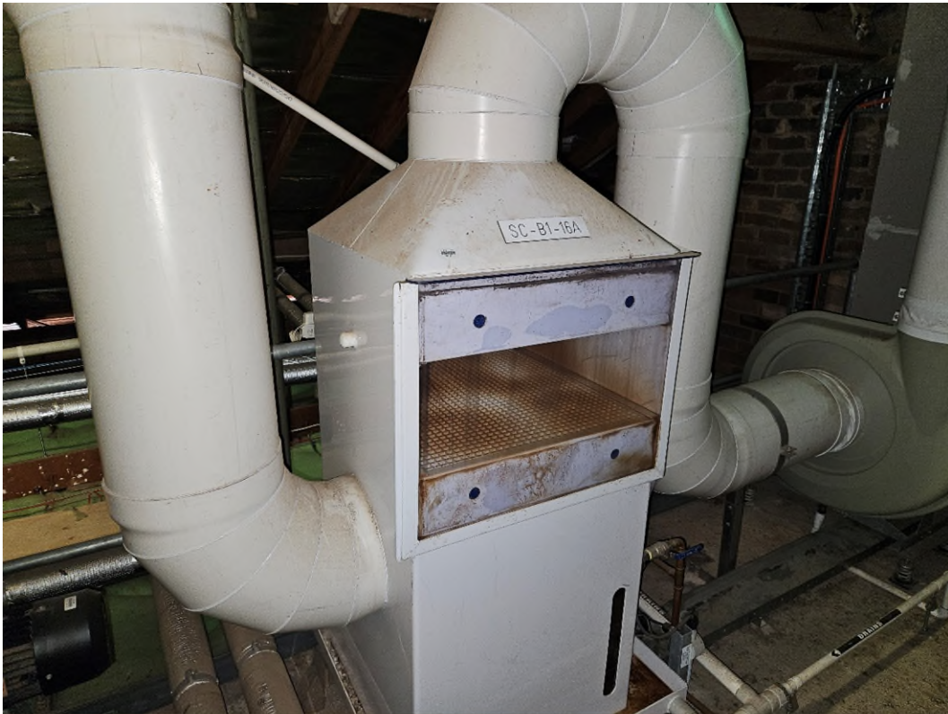
Figure 3: Open LEV system in roof space