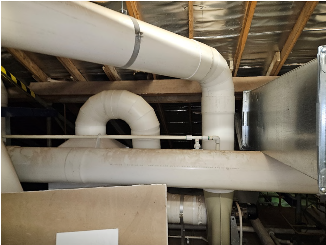
Figure 2: LEV system in roof space

High pressure liquid oxygen, nitrogen and chemical are piped through the roof space.