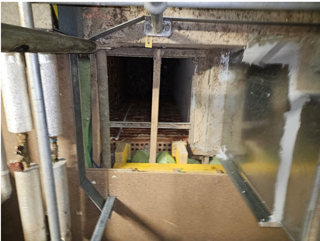
Figure 4: Crawl access in roof space