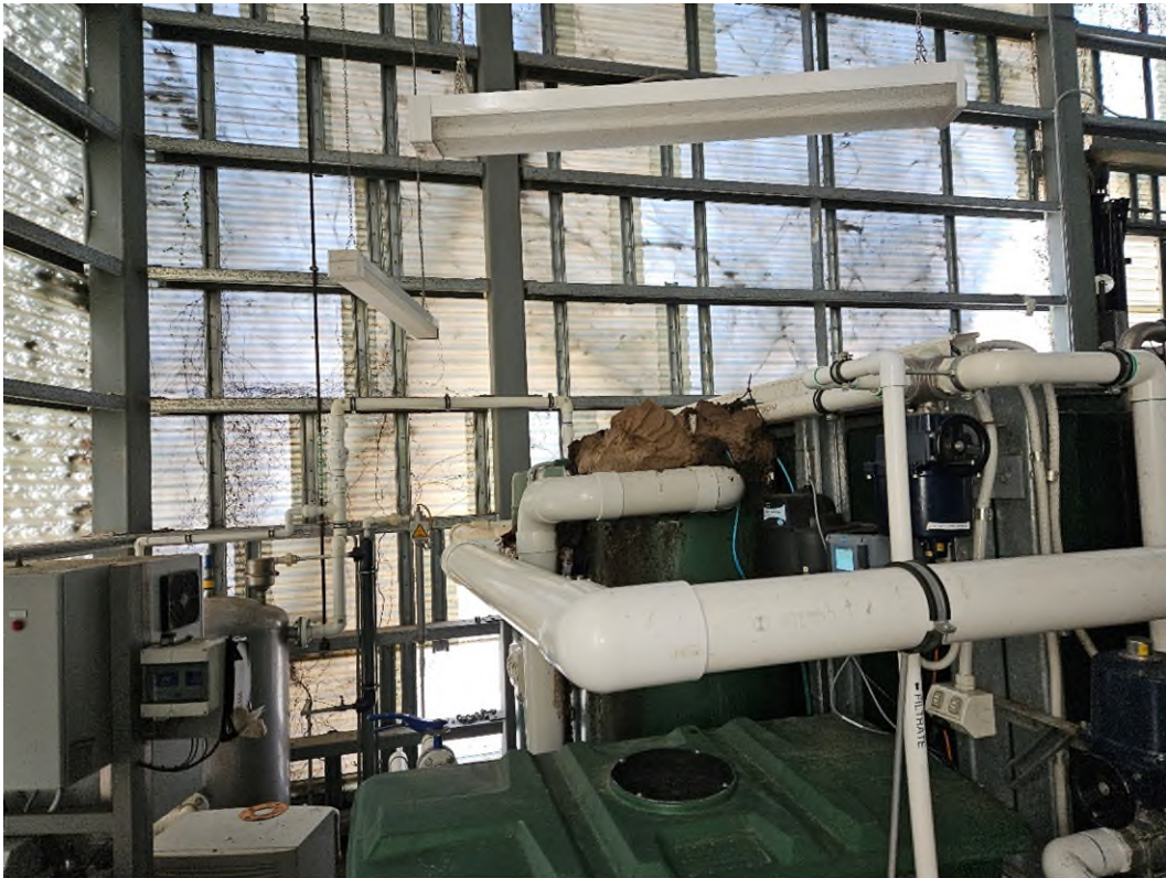
Figure 5: Leaking Waste - Building Services Building – 45A