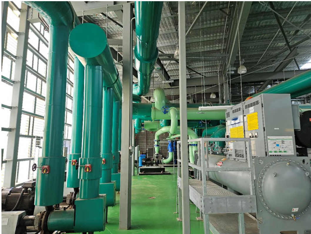
Figure 2: Building Services Building – 45A

Accessing the tanks for maintenance, annual cleaning or draining does expose the worker to the conditions within the tank, which require confined space entry procedures to ensure worker safety.