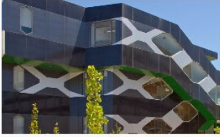
Introduction to GHS Introduction to GHS