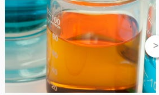
Module 1: Chemical Toxicology Chemical Safety