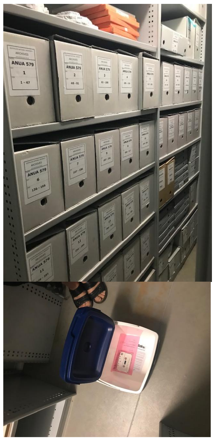
Images of material in the Archives cool room. The is one high risk item is in the single cooler in the store.

The major development occurred in 2012 when a cool room was built. It was constructed in level 1 of the Menzies Library and holds approximately 20% of the ANU Archives audio visual collection. It is approximately 80% full. The total capacity is approximately 100 metres of shelving.