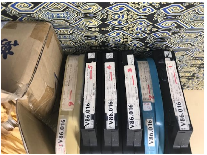
Image of material to be digitised for access by an ANU academic for current research

The majority of the ANU Archives audio visual material and all the Library audio visual material are stored in ordinary collection areas with no temperature, humidity of other controls to limit deterioration. Regularly there is water ingress into areas where this material is stored