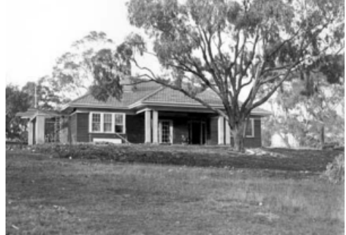
Cubby House on Campus (Building 67)