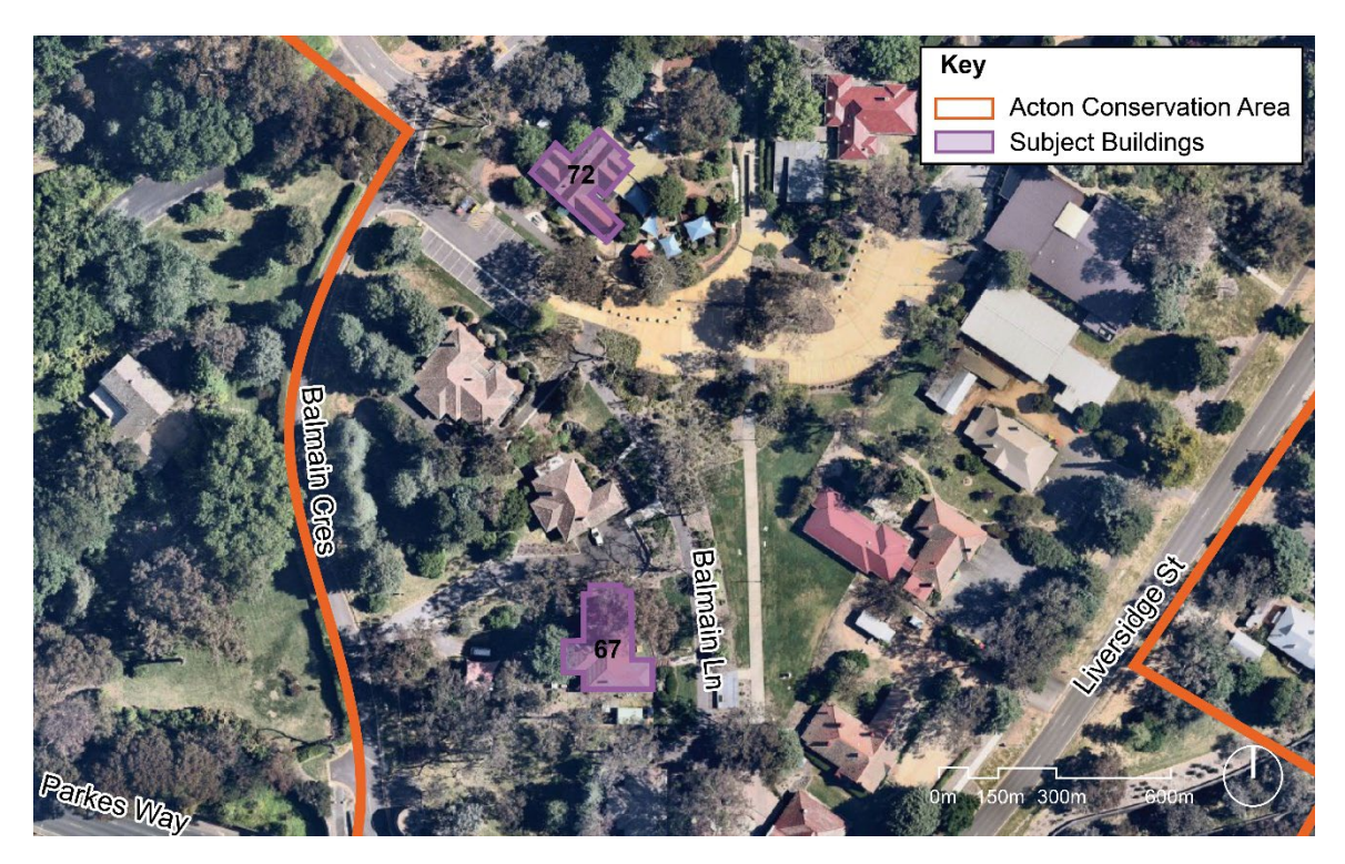
Figure 1.3 Boundary of Acton Conservation Area and the Acton Cottages where works are proposed.