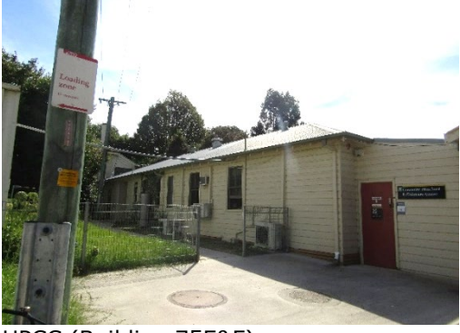
UPCC (Building 75E&F)