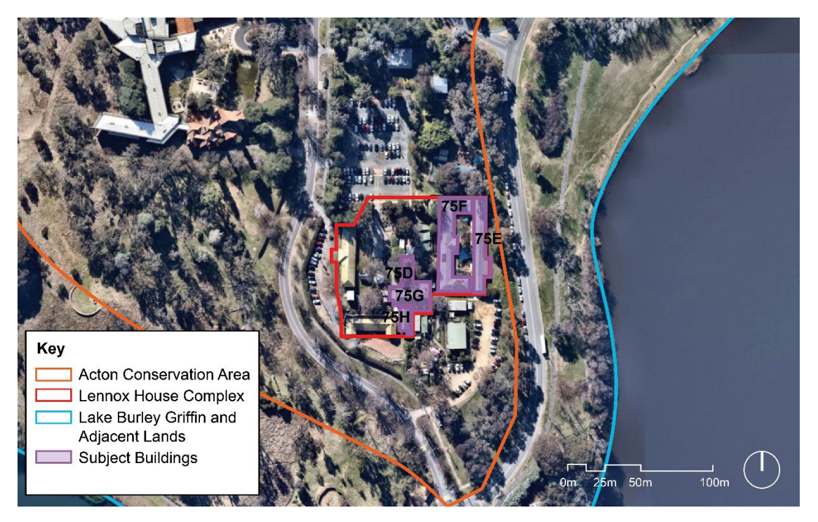
Figure 1.2 Boundaries of Commonwealth Heritage Listings relevant to Lennox House Complex and buildings where works are proposed.