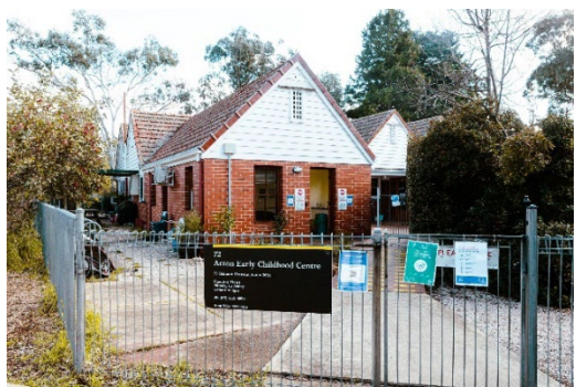
Acton Early Childhood Centre (Building 72)