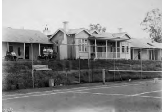
Heritage Childcare Centre at 15 Lennox Crossing (Building 75G)

Figure 1.3 Boundary of Acton Conservation Area and the Acton Cottages where works are proposed.