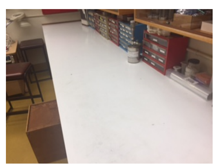
Remediation area - Room B1