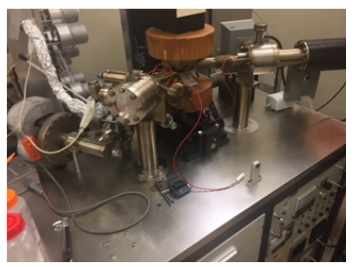
Remediation area - Room B1