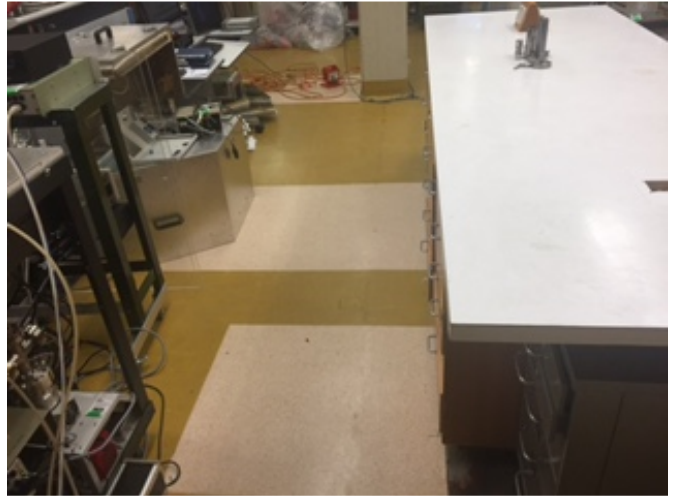
Remediation area - Room B1