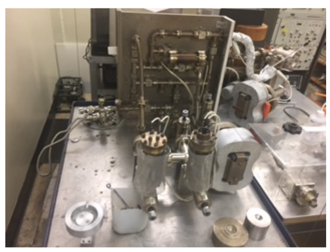
Remediation area - Room B1