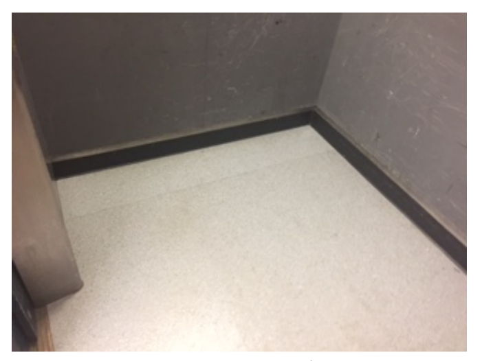
Remediation area - Lift