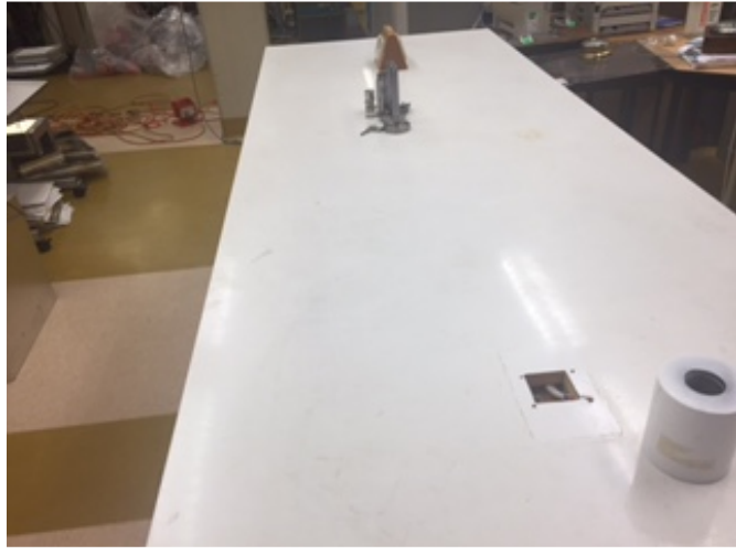
Remediation area - Room B1