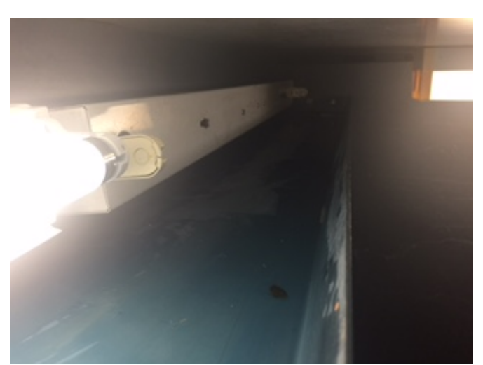
Remediation area - Lift