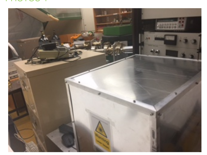
Remediation area - Room B1