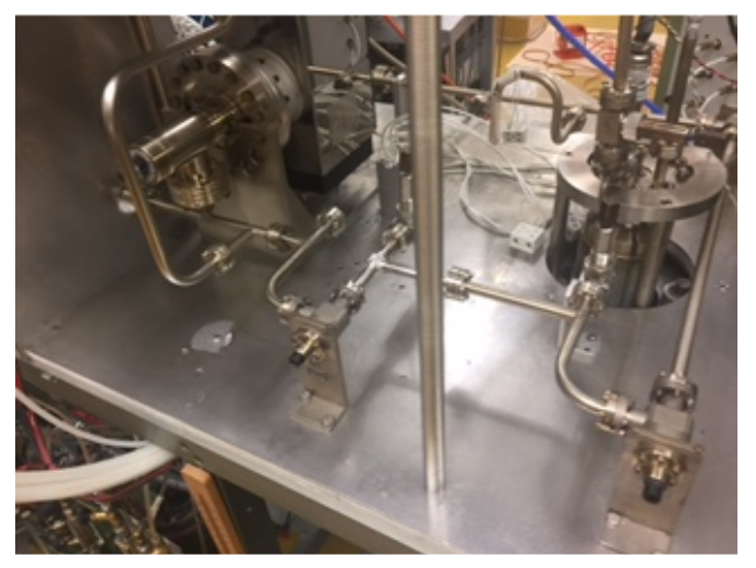
Remediation area - Room B1