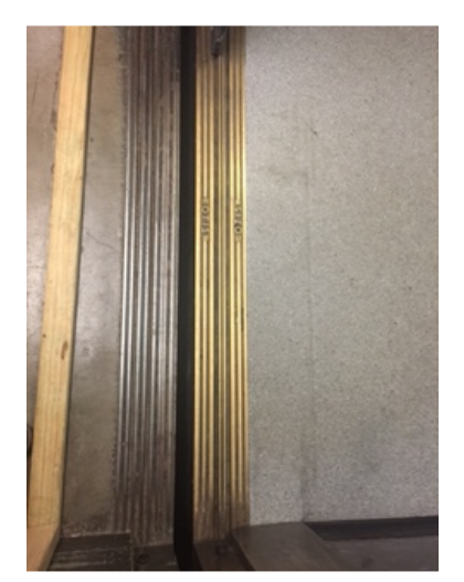
Remediation area - Lift