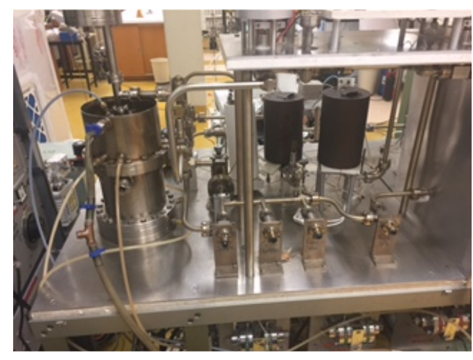
Remediation area - Room B1